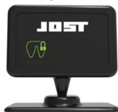
Dash Top Display