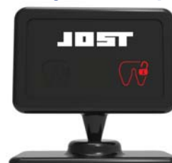
Dash Top Display